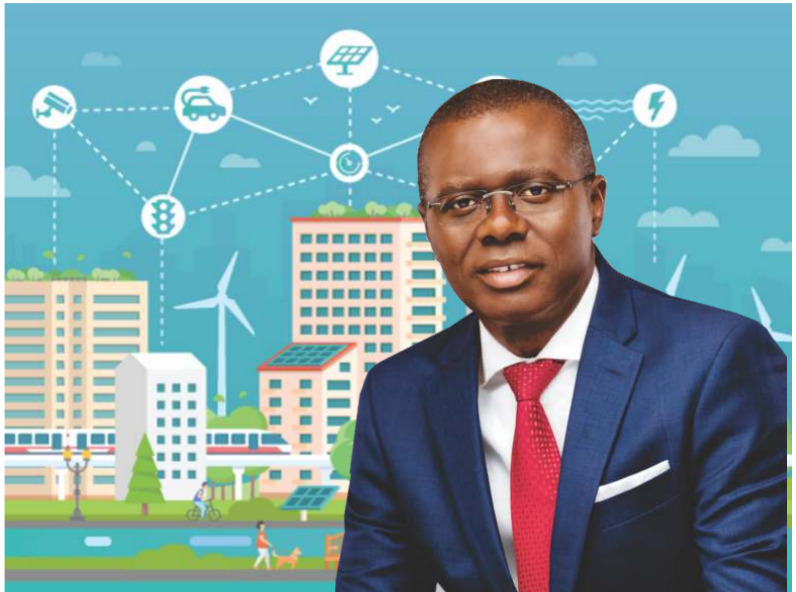
Gov Babajide Sanwo-Olu

Governor Babajide Sanwo-Olu said his government is committed to improving the