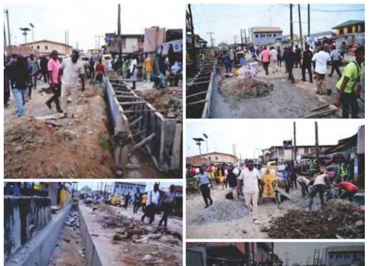
ongoing construction work at Mukandasi Street

lack of fund, but we shall ensure it is finished in time so that our people can enjoy the usage."