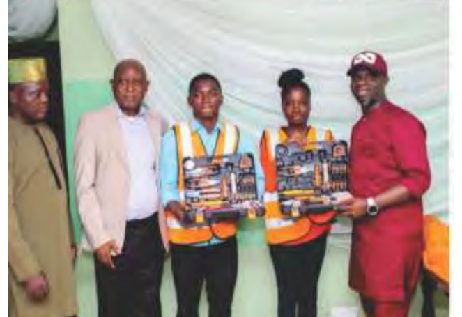
Youths inducted for training