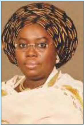
Hon. Idiat Adebule