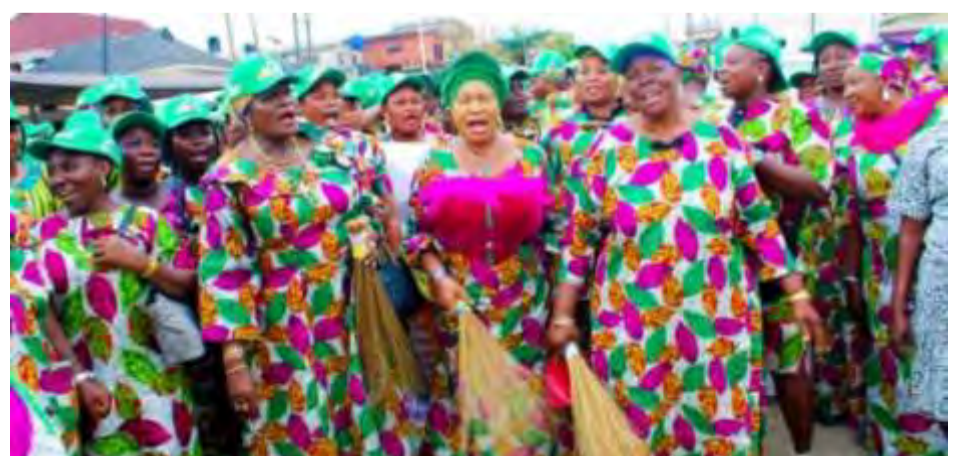
Market women at rally