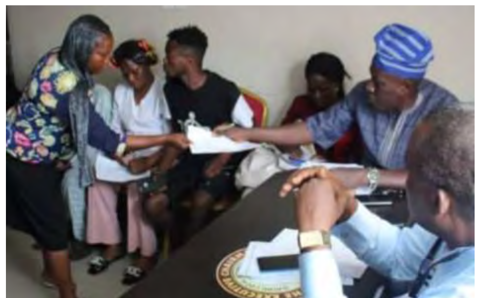
Beneficiary of waste to Wealth training

protection of the environment from degeneration and pollution, but would also create jobs, generate income and establish recycling businesses for the beneficiaries of the training. "Recycling exercise is explained to be a creative reuse that transforms waste materials, by-products and unwanted products into new materials or products of better quality and environmental value."