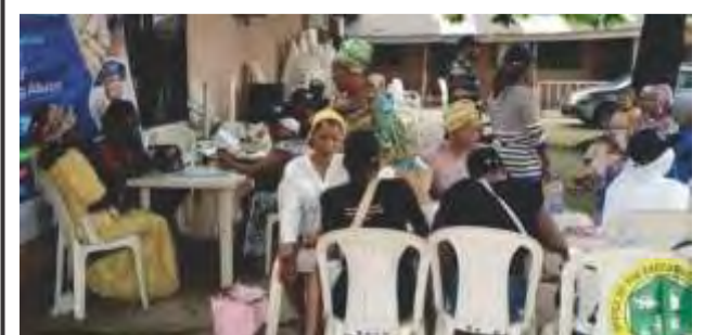
Residents receiving treatment

diagnosis, immunization, blood donation, supplement and health insurance to the teeming populace in the community, going from one strategic location to another. So far, 4,285 residents have been reached out to in the free healthcare service provided to address health challenges of the community people. Some of the areas covered include 14, Ajilete Street Beside Primary Health Center (PHC) off College Road, Orile Ogundimu Central Mosque at 1, Ogundimu Street, Iju and The City of the Lord Church at 25, Kudirat Soule Street, Coker Road.